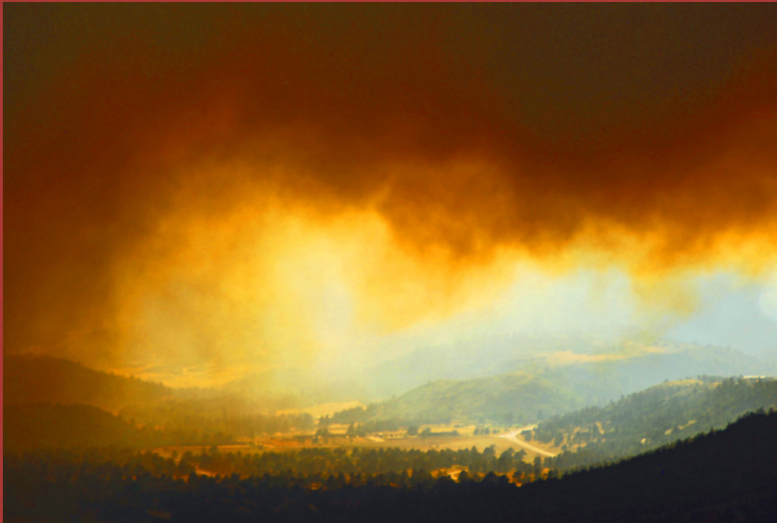
“Beneath the Smoke” by Sherwood Cherry