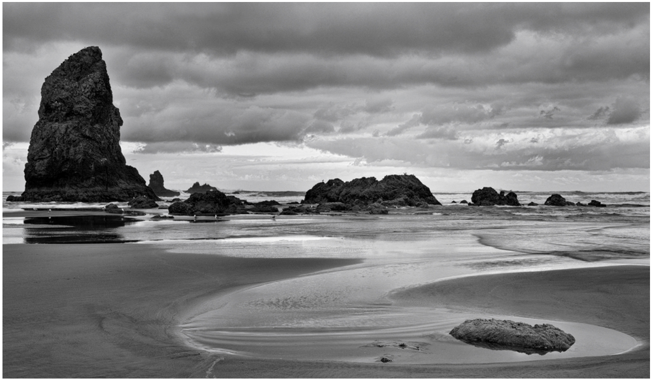
“Haystack Rock ”